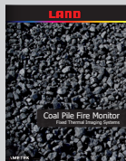
COAL PILE FIRE MONITORING

DISCOVER HOW OUR BROAD RANGE OF NON-CONTACT TEMPERATURE MEASUREMENT AND COMBUSTION & EMISSIONS PRODUCTS OFFER A SOLUTION FOR YOUR PROCESS