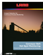
CONVEYOR BELT HOT SPOT MONITORING

SEE OUR OTHER COAL FIRE PREVENTION PRODUCT LITERATURE: