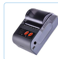
Bluetooth® Printer (Si-AQ Bluetooth® Printer)