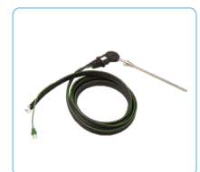
Sampling Probe (Si-AQ Probe with Hose)