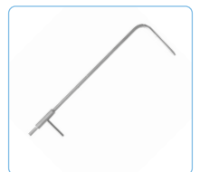
Pitot Tube for Air Velocity (Si-AQ Pitot Tube)