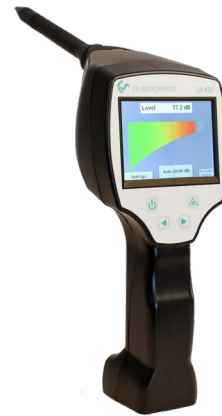
LD 450 with straightening tube and straightening tip for accurate detection.