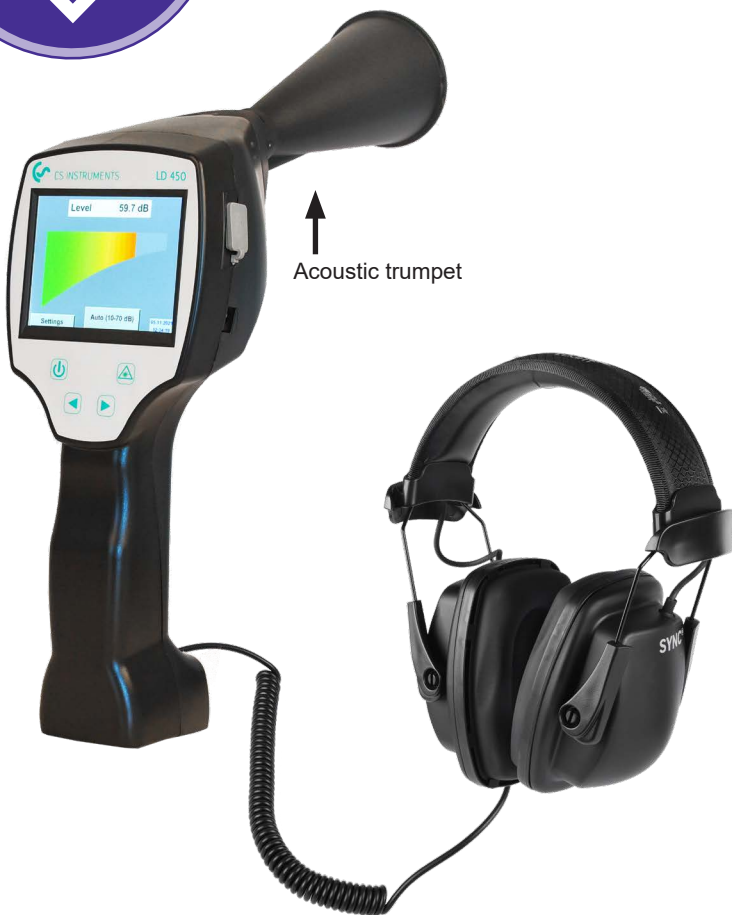
↑ Acoustic trumpet