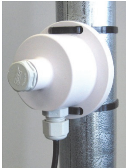
S-BPB Mounted to a Tripod Mast

Tripod: To mount the S-BPB on a pole or Onset tripod mast, use the cable ties provided, as shown in below.