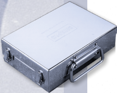
TB0046 Thermal Barrier