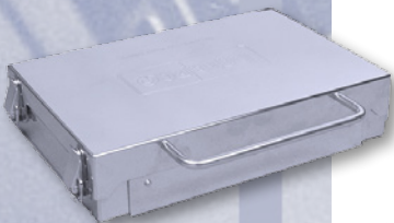
TB0045 Thermal Barrier