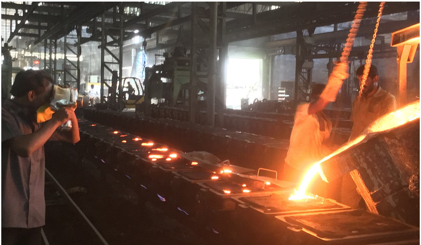
Measurement taken while pouring liquid metal into the moulds - Manual Pouring Lines.

There is the high accuracy of the Cyclops 055L-2F Meltmaster, even while taking the temperature of the pouring of the last mould. The instrument is renowned for its ability to measure real liquid metal temperatures, regardless of high-temperature