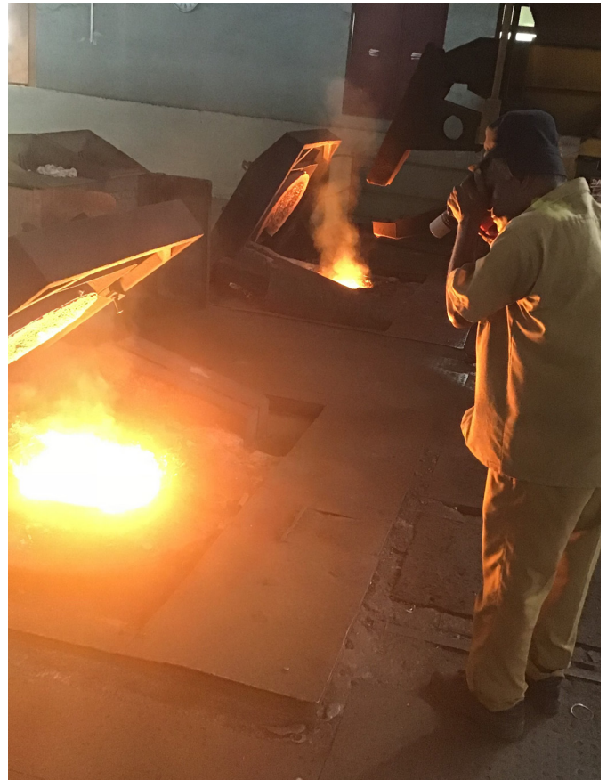
Measurement taken at the furnace location.