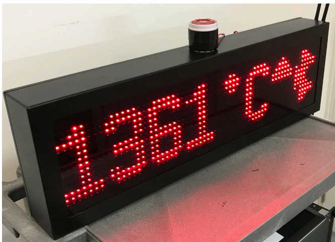
Bluetooth® Jumbo Display

The ergonomically friendly equipment is designed for single-hand operation, with contact-free measurement for better safety and easier use in hazardous environments.