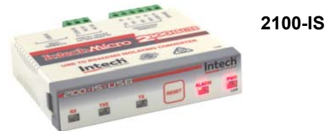
USB converter isolating Alarm for communication failure.