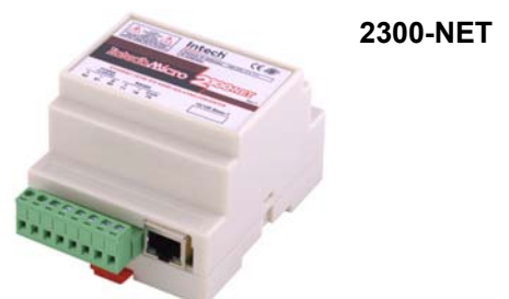
Ethernet TCP/IP to RS485 converter isolating

Note: The 2300-NET is used with the 2300 Series I/O Remote Stations when connecting via Ethernet TCP/IP. For the 2400/2100 Series I/O Remote Stations and Shimaden Controllers via Ethernet TCP/IP use the 2100-NET.